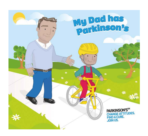
My Dad has Parkinson's (INFOP0006)