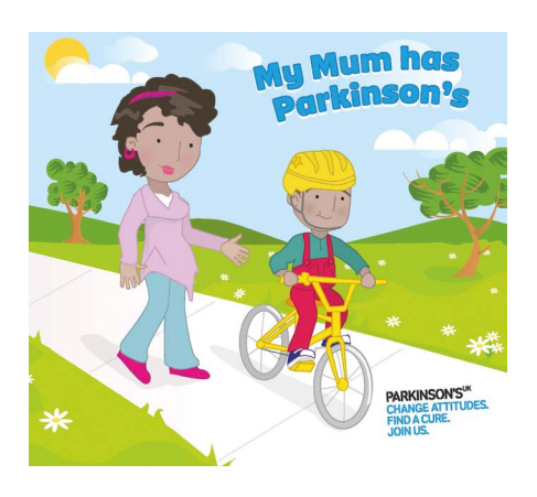
My Mum has Parkinson's (INFOP0009)