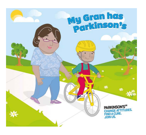
My Gran has Parkinson's (INFOP0007)