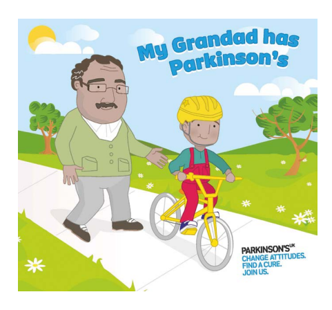
My Grandad has Parkinson's (INFOP0008)